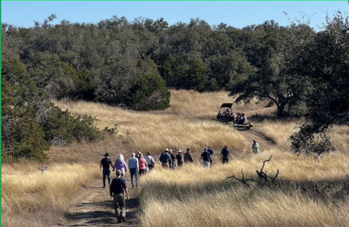
Anniversary Celebration Hayride and Tour